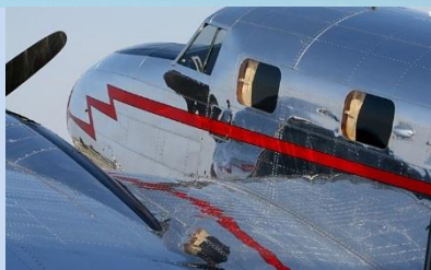
Les Whittlesey's beautiful Lockheed 12 will be on display

Museum Members Free Non-Members: $10 Parking Available In Museum Lot