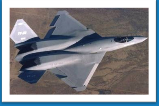
Northrop Grumman YF-23 "Black Widow" Stealth Fighter prototype on display at WMOF.